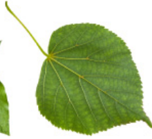
SMALL LEAVED LIME