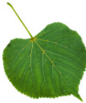
LARGE LEAVED LIME